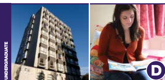
QUADRANT HALL £5,130.00 38 WEEKS