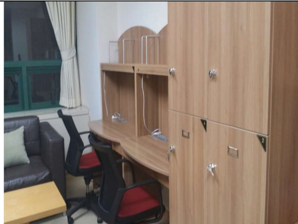
Desk, chair and locker