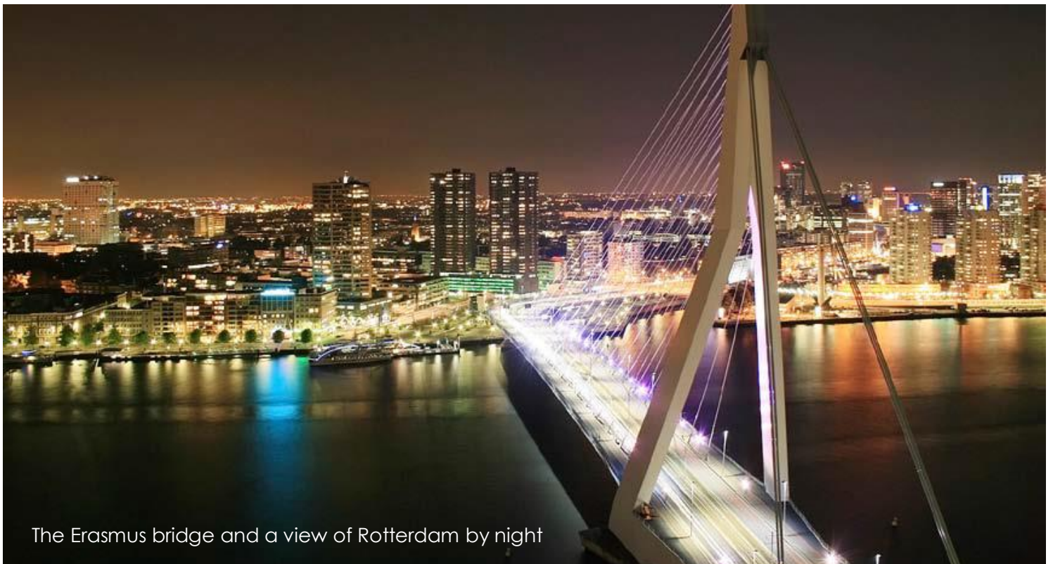
The Erasmus bridge and a view of Rotterdam by night

Now, almost seventy years later, a new, modern city centre has risen from the ashes. The avant-garde architecture is famous at home and abroad. Rotterdam has become a dynamic city bustling with activity.