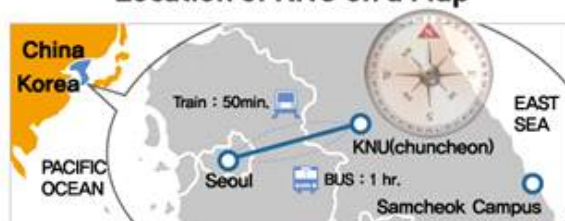
Location of KNU on a Map