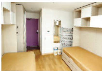
Hanlim Dormitory (On-campus student accommodation)

※ Others : Free internet access on campus, Sports facilities, Cafeteria, Library, Career Development Center, University Museum, Multi purpose auditorium etc.