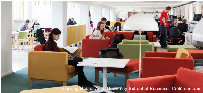
Learning Hub at Aalto University School of Business, Töölö campus