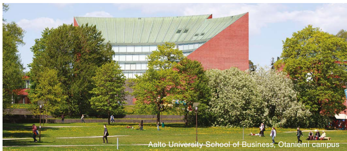
Aalto University School of Business, Otaniemi campus

More information about the campus and its development at http://www.aalto.fi/en/about/campuses/